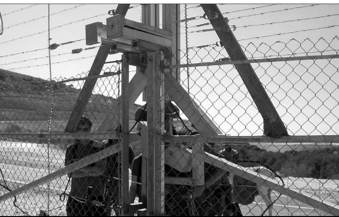
FENCE: Lecturers not fans