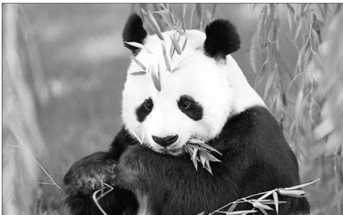
PANDA: By not recycling this paper this second you're killing the cutesy

It's easier to shoehorn all your conscience's need to provide coverage of climate change et al in one foul swoop