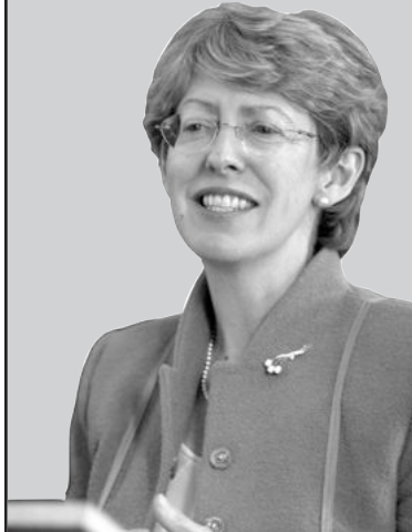
PATRICIA HEWITT: cares

A: Look, this government has put more money into the NHS than anyone else. Now what do you want, us or the Tories? Hmmm? Why, just last week David Cameron said he wanted to boil babies.