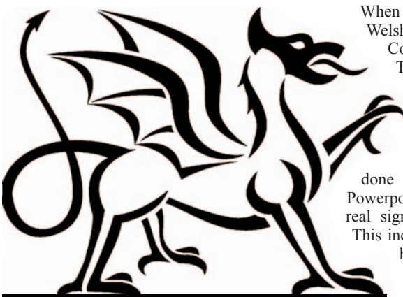
ASSEMBLY: Scrawny, like a chicken

In the end, it won't be the Assembly that makes a jot of difference to the quality of the Western Mail . Metro , the freesheet that's provided in about a dozen British cities, is finally coming to Cardiff. Trinity will finally have decent competition that might make them consider investing in their titles, instead of axing workers. But it illustrates how far the Assembly still has to go to prove itself as a real institution.