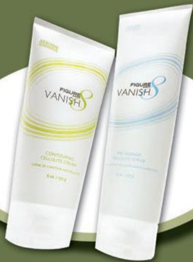
Figure 8 Vanish