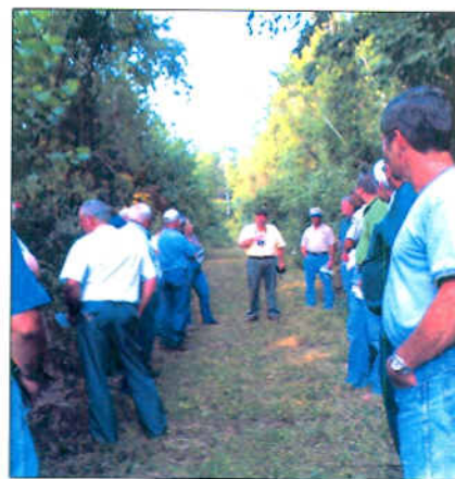
Tour participants stopped along the Atkins Trail to view the Chestnut trees that were planted there.

Near the wetland a demonstration area has been planted with native prairie grasses and wildflowers donated by Pheasants Forever. This area is managed to mimic the cycles of a natural prairie. This includes occasional mowing and controlled burnings that will help establish the prairie vegetation. A prescribed prairie burning removes growth-retarding detritus, warms the soil, and allows new sprouts to grow strongly without shading.