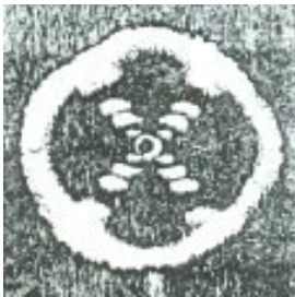
Xray Cross-Section of a DNA Molecule

'Jesus' takes His energy from 'God', just as it is being found that our Sun transmits energy to us in a frequency which our systems can assimilate. This is not to say that if we worship the Sun that we are worshipping Christ, for we are shown the energy behind the manifestations which we can see and comprehend.