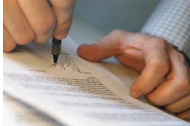
Essay Contest for 8th grade students