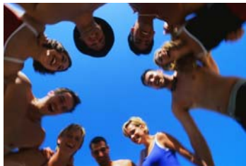
Mater Dei & Our Lady of Mercy Round Table

we have in the past, Mater Dei Council will continue to offer our assistance to Our Lady of Mercy Parish.