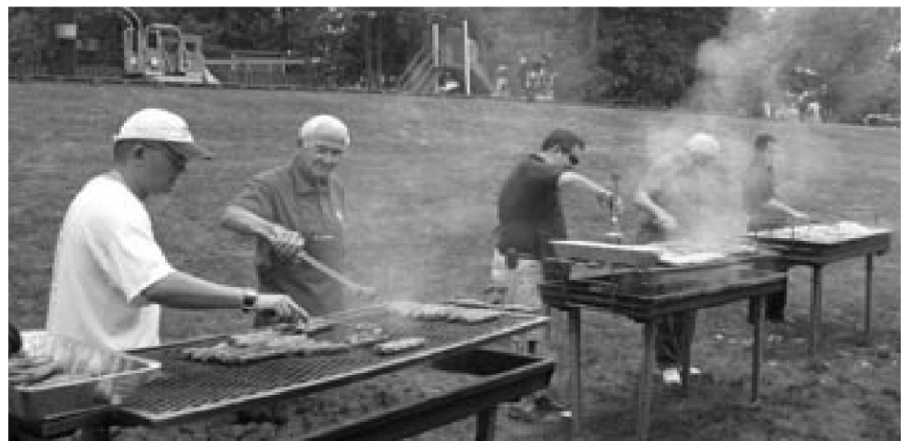
Council brothers work the "barby" for St. Raphael's Parish picnic