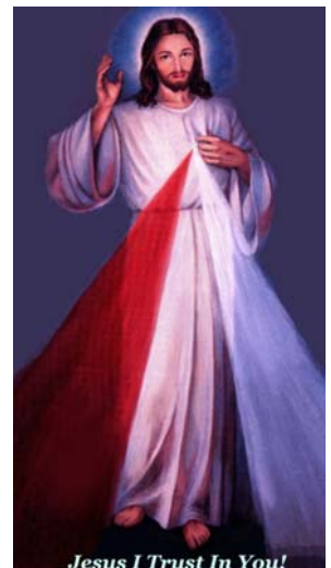
Jesus I Trust In You!

"The Blue Mantle" is a publication of Knights of Columbus, Mater Dei Council No. 9774, Rockville, MD. It is an unofficial publication and does not represent official opinion of the Knights of Columbus. It is published monthly.