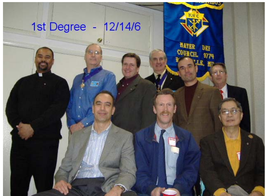
New First Degree Knights with Mater Dei Officers Congratulations to the new brothers!