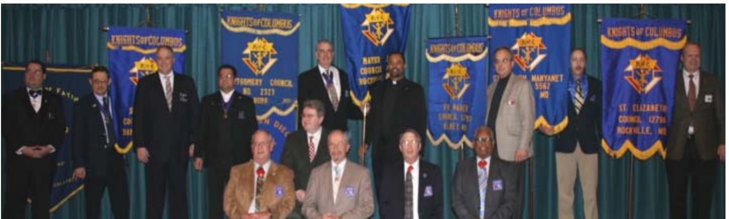
Knights of Columbus dignitaries at last year's Tootsie Roll Dinner