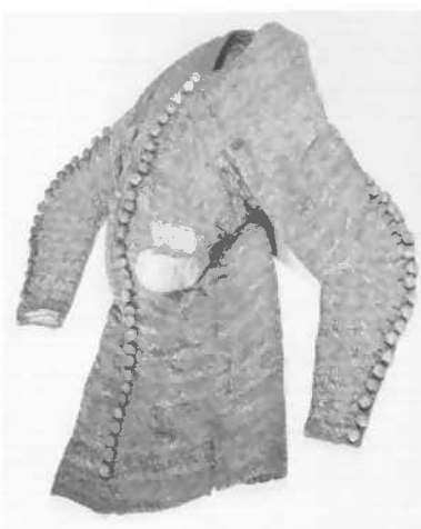
2. Charles de Blois pourpoint, 1364 silk patterned with gold. Some say it’s not quilted at all but rather conservation of the garment gives the appearance of quilting.