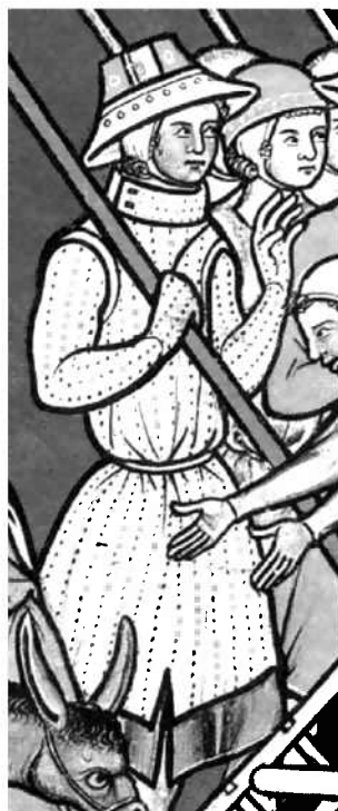
1. Maciejowki Bible, 1250. I think this is quilted but it could be a coat of plates. This armor is depicted many times in this bible but it’s definitely for lower class solders.

These three images are often used as examples of period gambesons. They are a good starting place though each image has it’s problems.