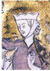
1. The Lady rejects Sweet-Look's heart. From Le Roman de la Poire , Paris, c. 1260-70.