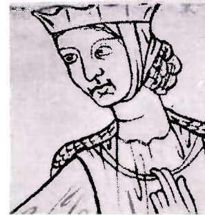
2. Villard de Honnecourt. Page from a Model Book. c. 1230 to 1240.

In the 13th century the veil which had been the predominate form of women's headdress in Western Europe gave way to a new style. There's no one good