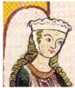
4. Manessa Codex. Germany. c 1300.

I fiddled with several different ways of making this style that involved a rectangle of linen and sometimes a rectangle of buckram. The one that is stiffened by several layers of linen (and no buckram) is packable and washable but takes a lot of fussing and ironing to stand up right. If the top of each pleat is pulled open and smashed you can get something like the “pork pie” hat pictured in the Manessa Codex. (Fig. 4)