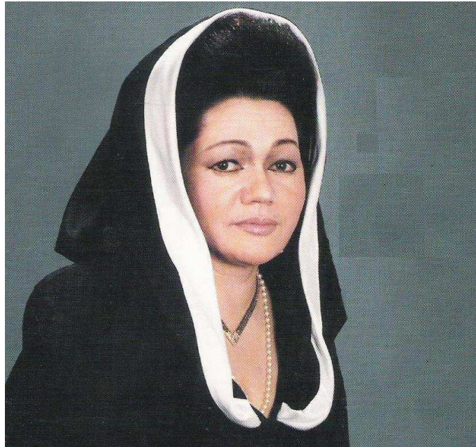
Soprano Lydiya Abramova