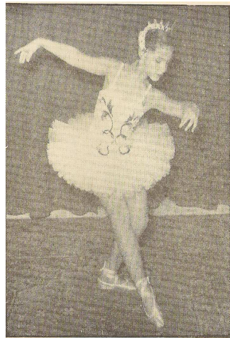
Ballet dancer Tanya Bajona