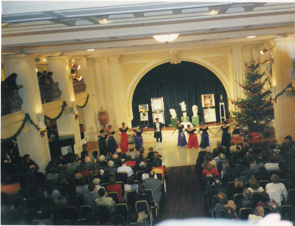
A Ballet Performance at one of the Malta Cultural Institute's Concerts

Today the policy of the Malta Cultural Institute is to revive the aims for which it was originally founded, by opening up its horizons to include all forms of Culture and the Visual Arts. In fact, besides Concerts, we organise Painting and Ceramic Exhibitions, Book Presentations and Classical and Modern Dancing. We also plan to include Drama and Prose and Poetry Readings.