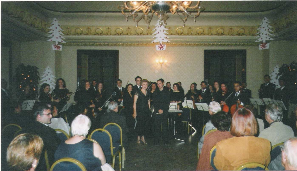
The San Gwann Local Council Orchestra