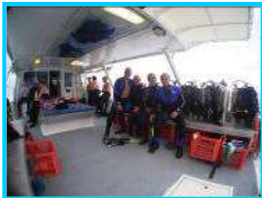
Blue Water Dive boat HMAS Brisbane