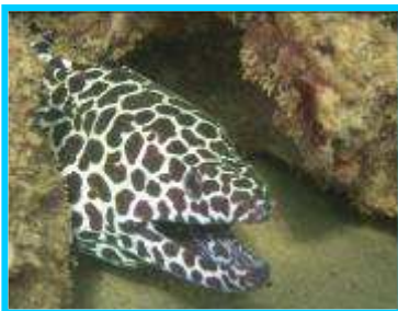
A Flat rock resident