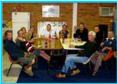
Clubbies Q Dive Centre

The social highlight was a BBQ on Sunday with lots of liquid lubrication, top food, the usual diving exaggerations, lies, good/bad jokes (thanks to Chas & Lionel) etc. The diving included the famous fish rock cave (Australia's best ocean cave) with lots of fish, wobbegongs, crayfish etc and the thrill of diving a brilliant underwater cave. Other highlights included regular sightings of grey nurse sharks and prolific sea life. Do not miss the next trip.