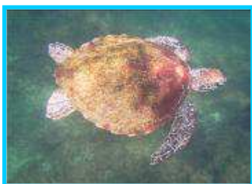
Turtle Bargara boat dive