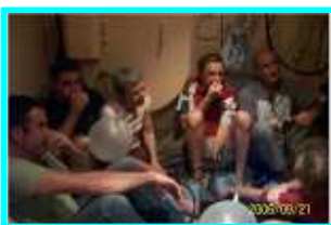
Clubbies blowing down

range. Our hire equipment is state of the art and we offer equipment servicing, hydro testing, air and nitrox fills, local, interstate and international dive travel and fun club activities. Sunshine Coast DIVE CLUB members are entitled to a 10% discount on all charter activities AND special deals on gear purchases. Just call us anytime on 54471300 or pop in and see us in our new shop at Noosa Harbour Marine Village. SEE YOU THERE!