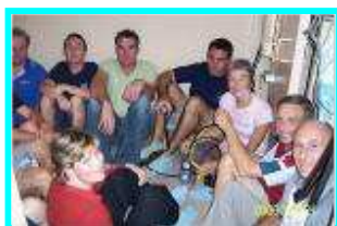
Ready for blow down

'Donald duck voice, big time, then the laughter sounded stupid too, so it got worse.'