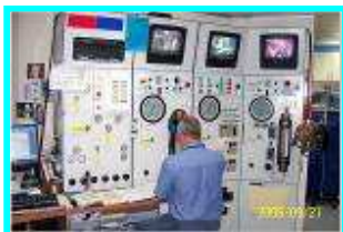
Air panel and operator

The chamber 'dive' to 50m was both an experience and a laugh!