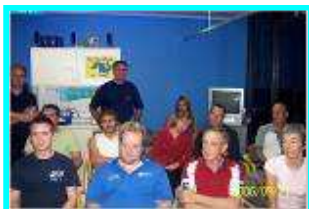
Slide show and talk

First we had a slide show on pressurised underwater habitats, both past and present, then a talk about how the chamber worked, what it was used, and safety procedures.