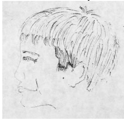
Defendant Jack Merridew