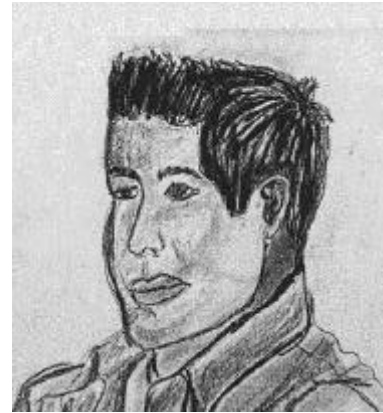
Defense Lawyer David Silverstein