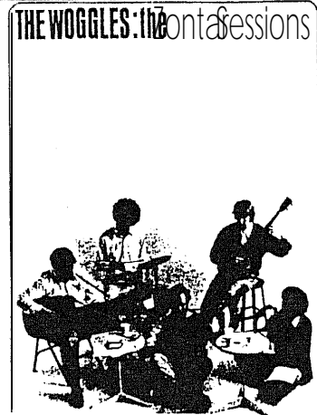
TEENDANCEPARTY - The Woggles The Zontar Sessions [Estrus]