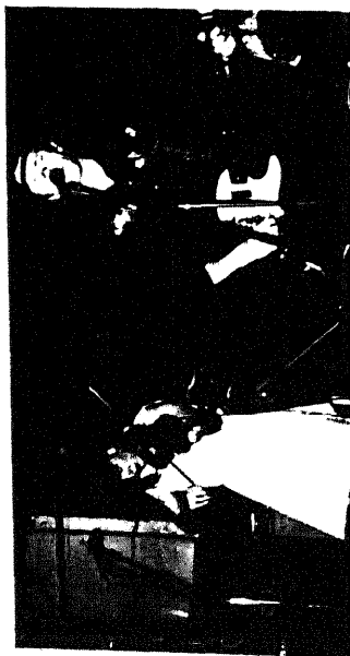
MAID MIDD M

Wanda: 6 bodies is a lot of people onstage. Especially with all the small stages around here. 5 bodies feels really comfortable.