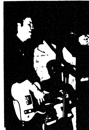
& Kid Coyote