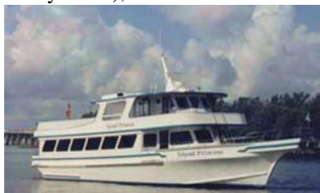
The Island Princess.

other districts and just hang out. Saturday will be the Directors meeting in the morning and then everyone can chill by the pool (yes, there IS a bar – Mai Tais for everyone!!!), or take the shuttle to