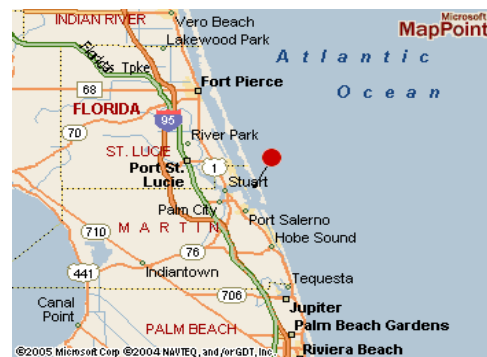
Marriott Hutchinson Island map.

Book early to get your reservation in BEFORE October 15 th . After that date we can't guarantee the Conference price or even room availability. Call the Marriott Hutchinson Island Resort directly at (772) 225-3700. Their web address is http://marriott.com/property/areainfo/default/pbiir?WT_Ref=mi_left