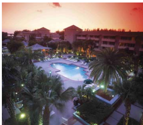
Pool at the Marriott Hutchinson Island.

the beach, or charter a fishing trip, or rent wave runners, or play golf