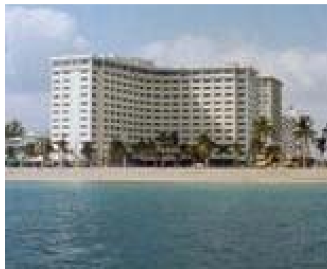
Holiday Inn on Ft Lauderdale Beach.

The best part (after THE BEACH) is we want everyone to bring their Moms with them, 'cause it's going to be on Mother's Day weekend and it's just not nice to leave Mom at home while you go to THE BEACH. I really hope we get to see you Friday, May 9 th thru Sunday, May 11 th at the LPA District 4 Spring Regional 2003. Just in case you didn't get my subtle hints earlier, bring a swimsuit because it's ON THE BEACH!!!