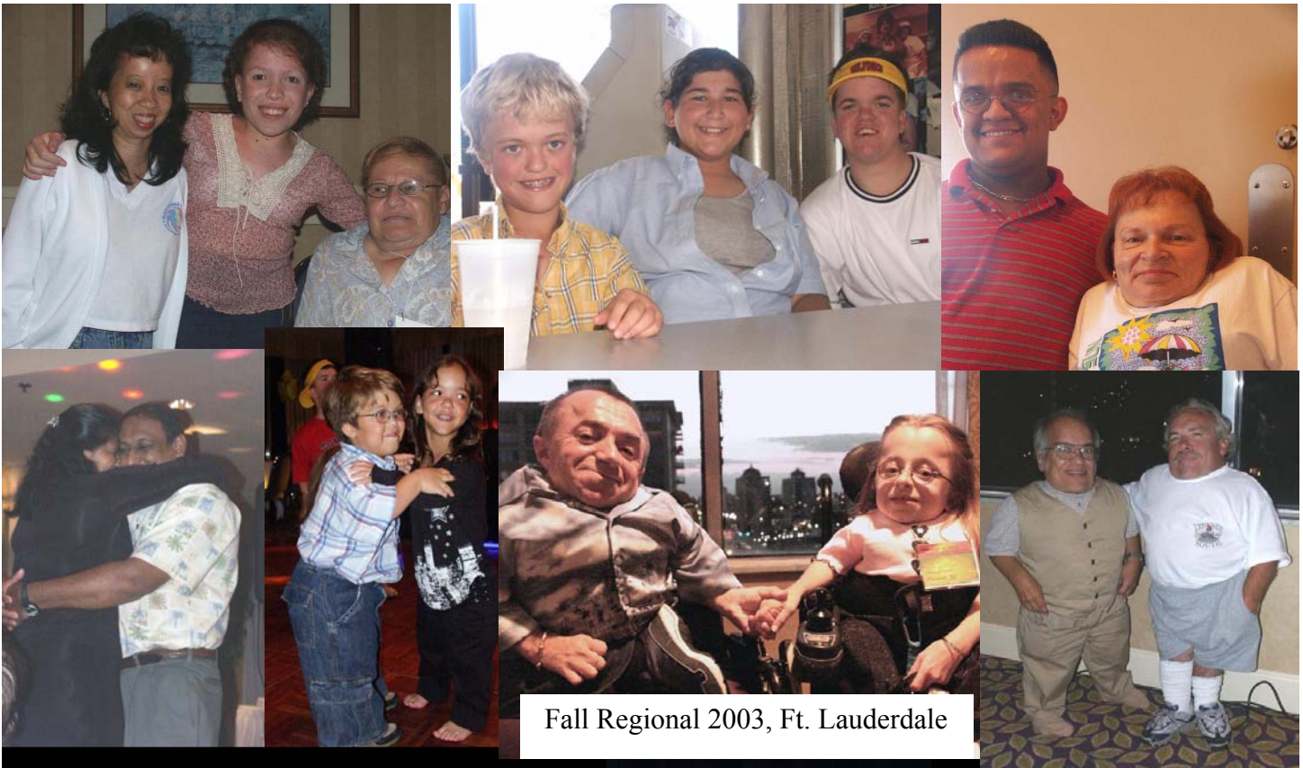
Fall Regional 2003, Ft. Lauderdale