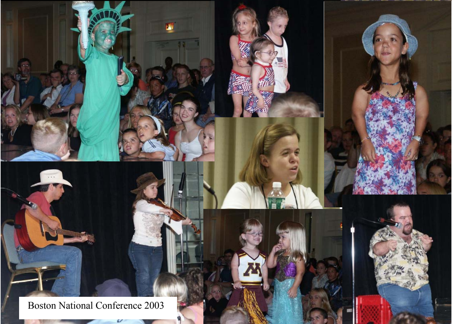
Boston National Conference 2003