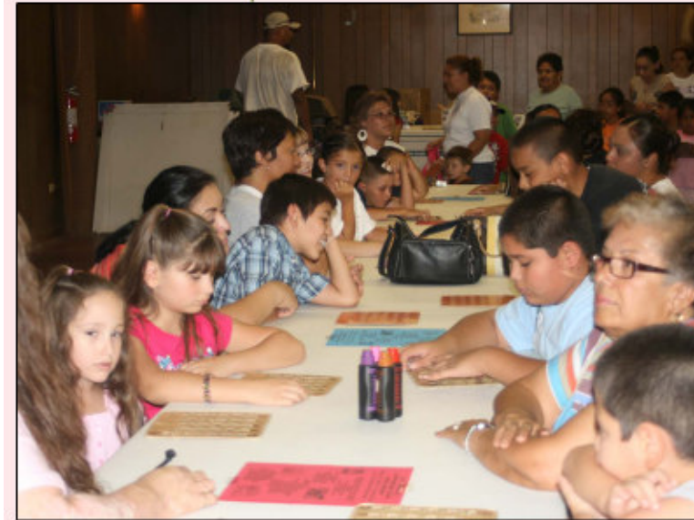
At left, just a few of the kids who took part in Kids Bingo. It was standing room only in the Lodge.