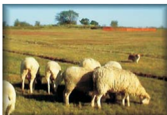
Pembroke Welsh Corgi

Beginning with the first herding instinct evaluations January 16, 1997 at End Gate Ranch in Ferris Texas, it became obvious that most herding breeds of dogs have natural herding instinct around livestock and the particular style varies with the breed.