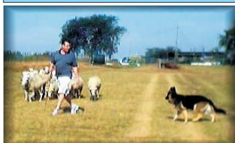
German Shepherd Dog