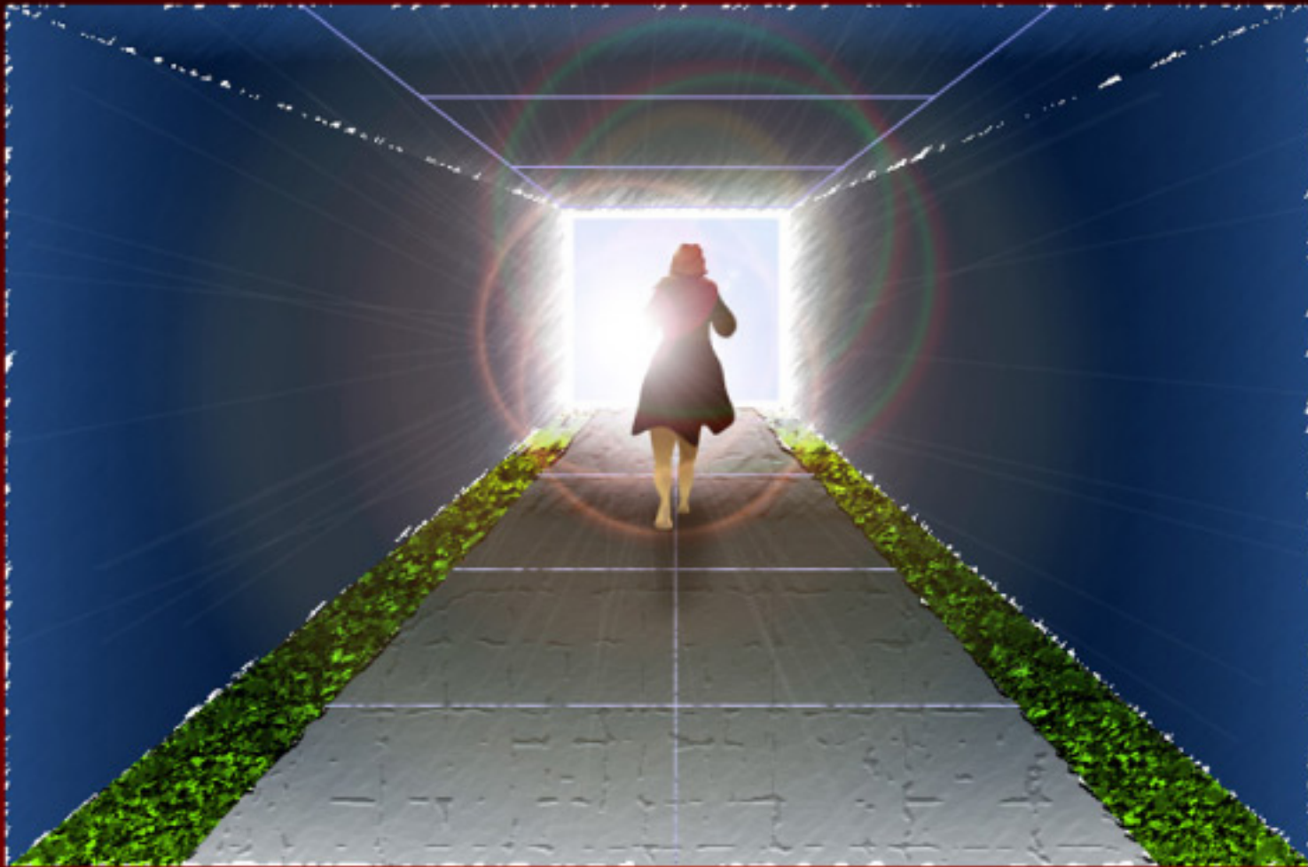
“Hallway of Despair”

For the last of three spot illustrations I wanted to symbolize the loneliness and pain that is associated with the loss of love. The poem I wrote ends with this emotion so I drew a figure walking down a long hallway. The figure has their back towards the viewer to help the viewer be able to associate this faceless figure as being anyone, even themselves. I used gradients to create the color variations which flow throughout the hall way. I applied texture to the sidewalk and the grass area.