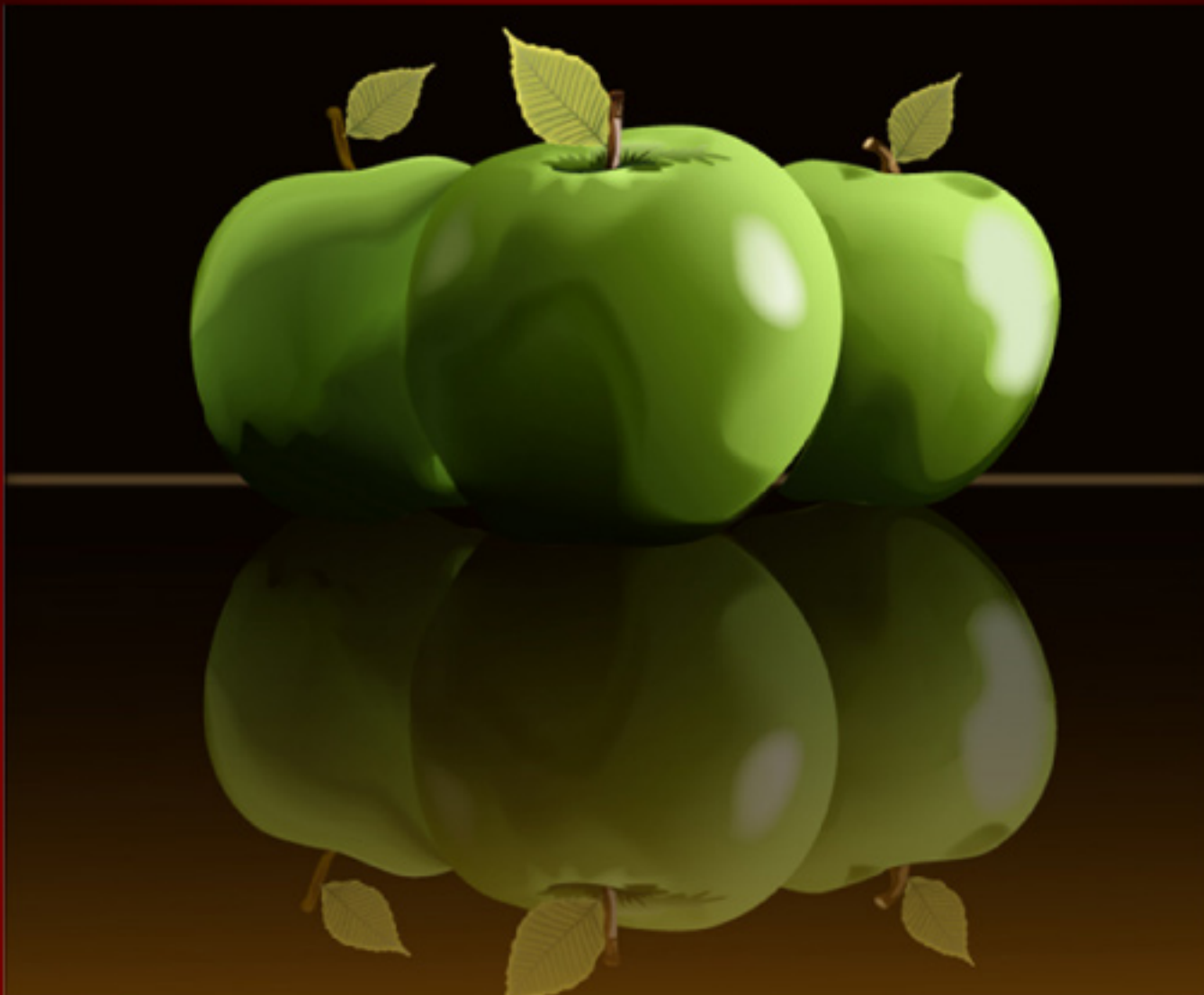
“Reflections of Granny Smith”

Week four brought yet another level of realism to my apple illustrations. This week I wanted to illustrate something with a dynamic appeal. After drawing the three apples, I used a combination of gradients and color blends to create the look of a smooth surface for the peelings. I wanted this illustration to demonstrate a nice use of contrast by allowing shadows and highlights to actually bring this piece to life. I used a black background to push the level of contrast to be seen much more easily. I wanted to show a reflection of the apples by creating the illusion of a highly reflective surface. The soft and subtle reflections helps give this composition a wonderful yet dynamic style and appeal.