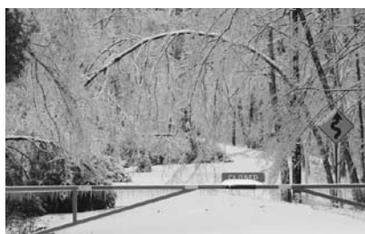
Ice, snow and wind storms ripped across Kentucky January 27, causing road closures and electric outages of over a week at many post offices