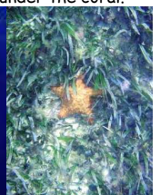
Starfish: Fierce hunters of clams and oysters.