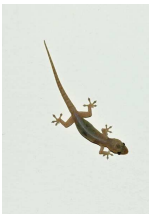
Gecko: Look on the walls near the rooms.