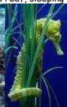
Seahorse: Hide in floating seaweed.