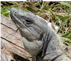
Iguanas: All kinds of iguanas can be seen sunning themselves on the paths between the buildings, especially on the beach/caribe side. They won't hurt you, but they are very used to humans and won't skitter out of your way either. They may hiss at you if you get too close.