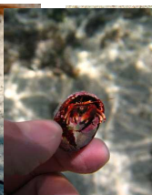
Hermit Crabs: Most often found at dusk.