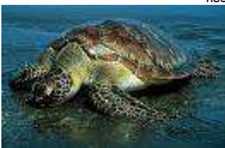
Green sea turtle

Look for turtles in the ocean between the Tropical and the Palace. Be quiet and don't use flashlights on the beach at night, April/May is nesting season.