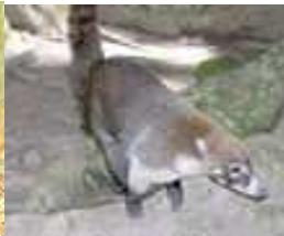
Coati: Member of the racoon family, but active during the day. Rarely seen on the resort.