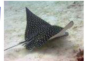
Spotted Eagle Ray