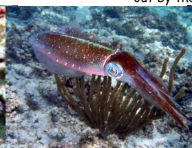
Cuttlefish: These cephalopods can rapidly change skin colours to camouflage and communicate.