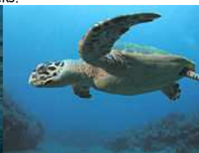
Hawksbill Sea Turtle

Look for turtles in the ocean between the Tropical and the Palace. Be quiet and don't use flashlights on the beach at night, April/May is nesting season.