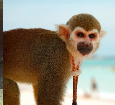
Spider Monkey: Although native to the area, usually only this captive one is seen on the resort.