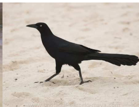
Boat Tailed Grackle