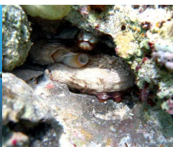
Octopus: Usually squeezed under coral, as shown here.