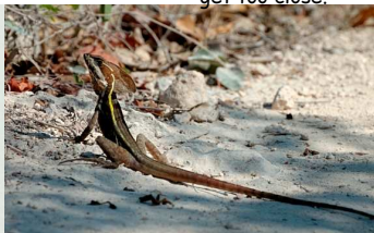
Ornate tree lizard: Very long tailed lizards. The males have bright blue-green patches on their chests and necks.