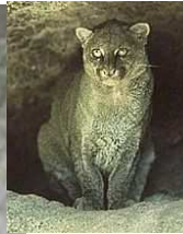
Jaguarondi: A small (house cat sized) wild cat. Rarely seen