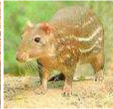
Paca: Sometimes seen in the long grass. About the size of a small pig.