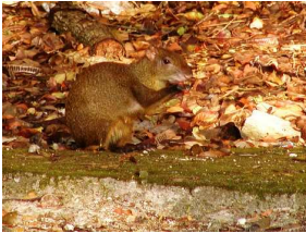
Agouti: Often seen in the early morning all over the resort. Related to the guinea pig, but longer legs

Here are some of the cool critters and creepy crawlies you might see around the resort. Almost all of these creatures have been sited at the Barcelo Maya, and most of these pictures were actually taken there!