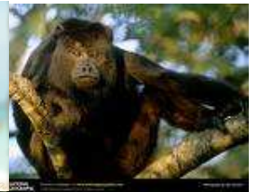
Howler Monkey: Are sometimes seen in the jungle surrounding the resort.