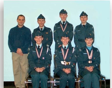
676 Kittyhawk Biathlon Team