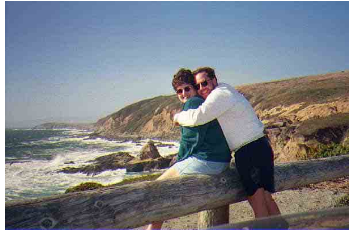
At our favorite place, the Northern California coast

We love to tell the story of how we met. It was a hot day in August in 1992 at a Habitat for Humanity workday. We were scraping paint and repairing a home in one of the older neighborhoods in Sacramento. We hit it off from the start. We loved being together and were married in 1994, to be together forever.