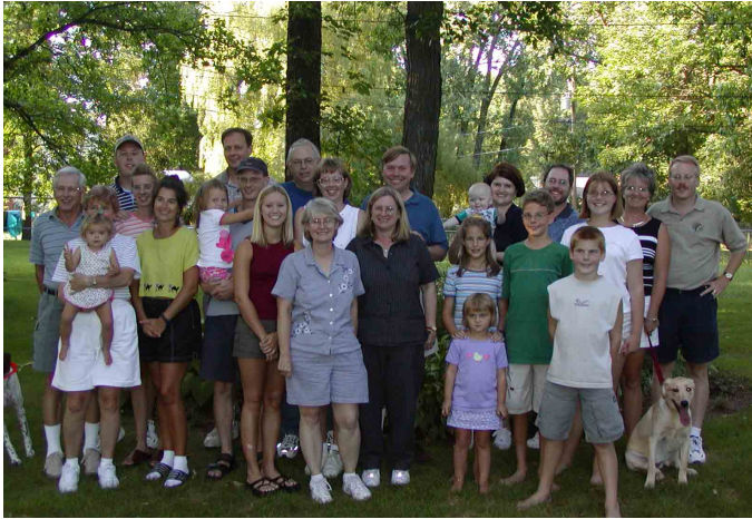
Bauer family reunion