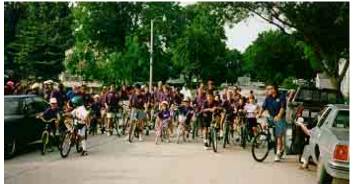
Getting ready to start at the Fitzgerald Family Bike Ride

We feel very lucky to have the love of many friends and big families.