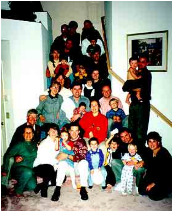
Families from the Married Couples Group get together for special events