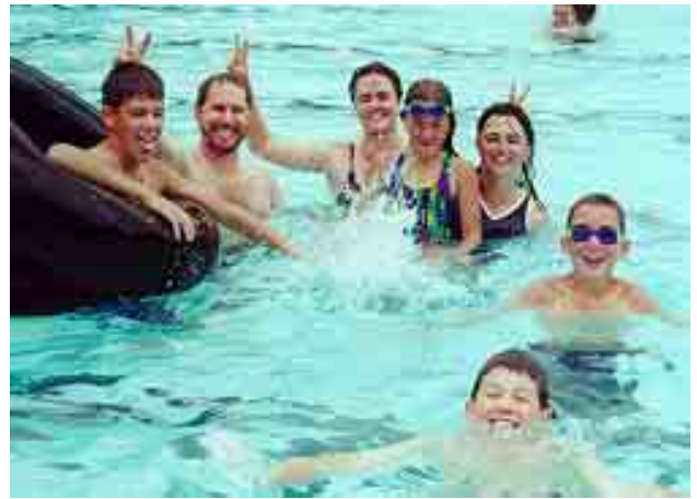
Family fun at the pool.