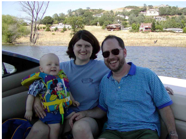
Relaxing on the lake in our friend's boat

We have so much respect for you as you make this decision. Please feel free to contact us to get to know us more. We can be reached through Adoption Connection toll-free at 1-800-972-9225 or by email at kfbauer@yahoo.com .