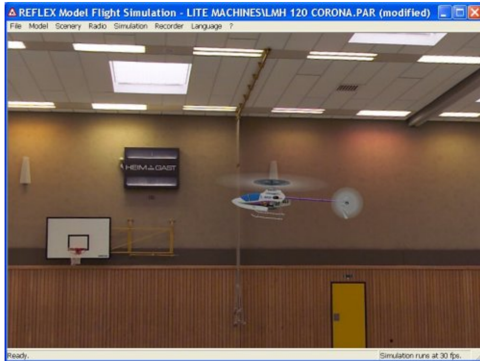
Reflex XTR - Indoor flying Corona