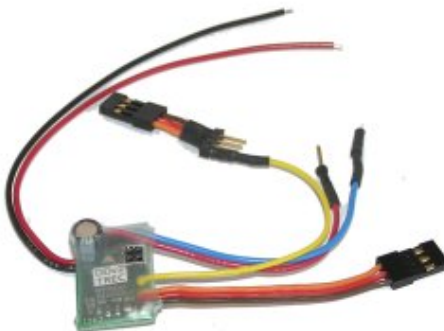
TREC ESC by Dionysus Designs

The TREC ESC by Dionysus Designs is a special ESC with built-in mixing options. It is a tail motor ESC that can read the throttle signal and do its own revo mixing. It also has many other features such as a 17 point throttle curve, low voltage monitor, etc. and weighs only six grams.