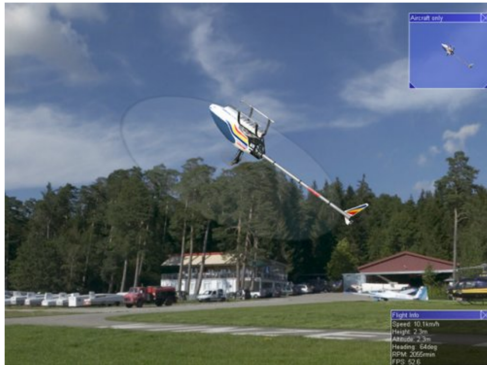
Aerofly Pro Deluxe

Further information is available from www.aerofly.com/dehome.html .