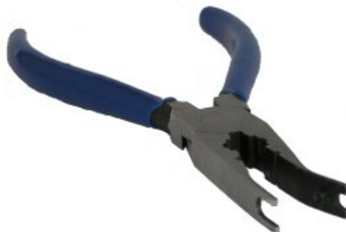
Ball Link Pliers

A special plier made especially for handling ball links. It can quickly remove the ball joint from a ball link without damaging either part. One jaw has a U-shaped cut in it and the other jaw has a small cup on it to hold the ball joint.