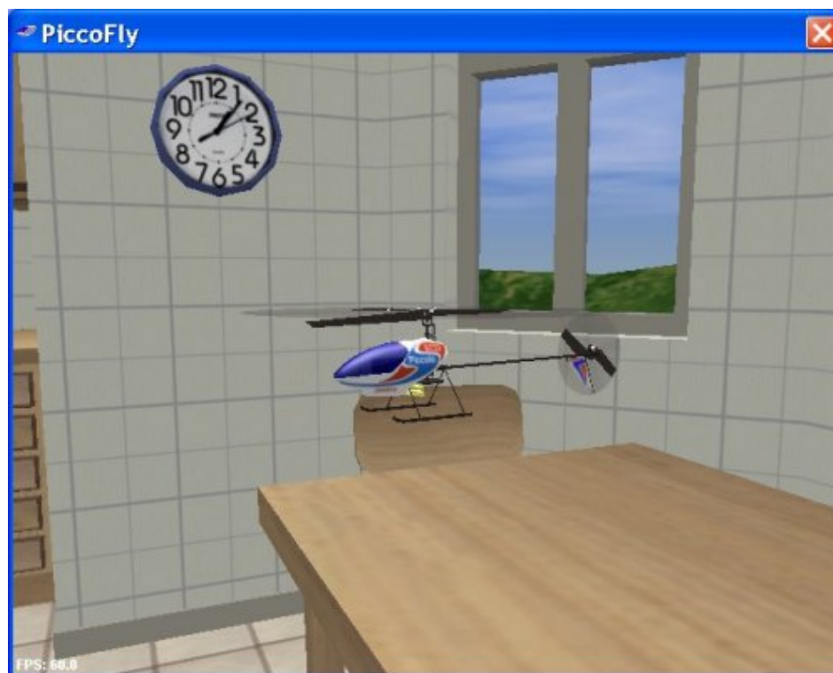
Piccofly - in the kitchen

Piccofly is excellent for learning to fly the FP Piccolo and clones. It doesn't model forward flight well, but it simulates the "squirreliness" of hovering the fixed pitch micro helis very well.