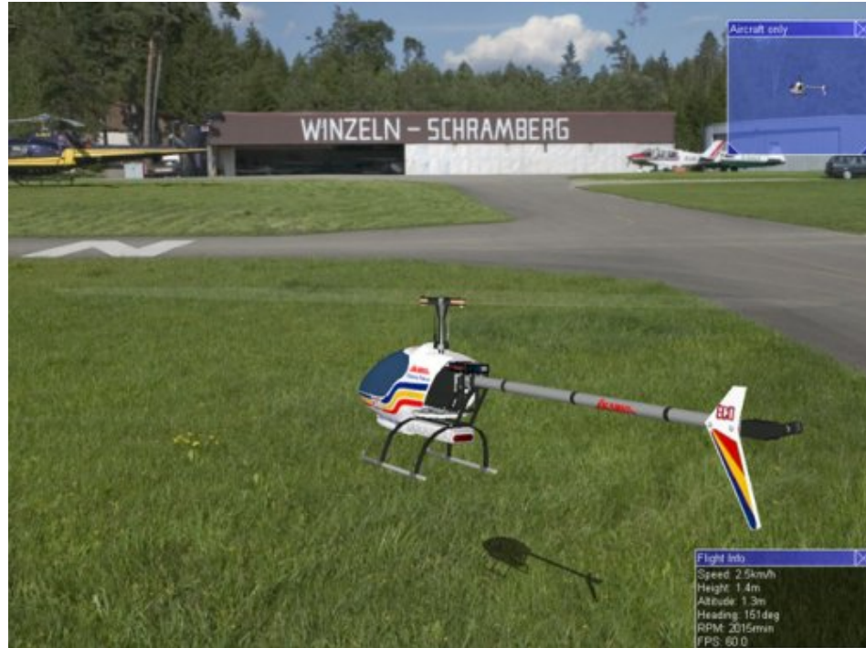
Aerofly Pro Deluxe