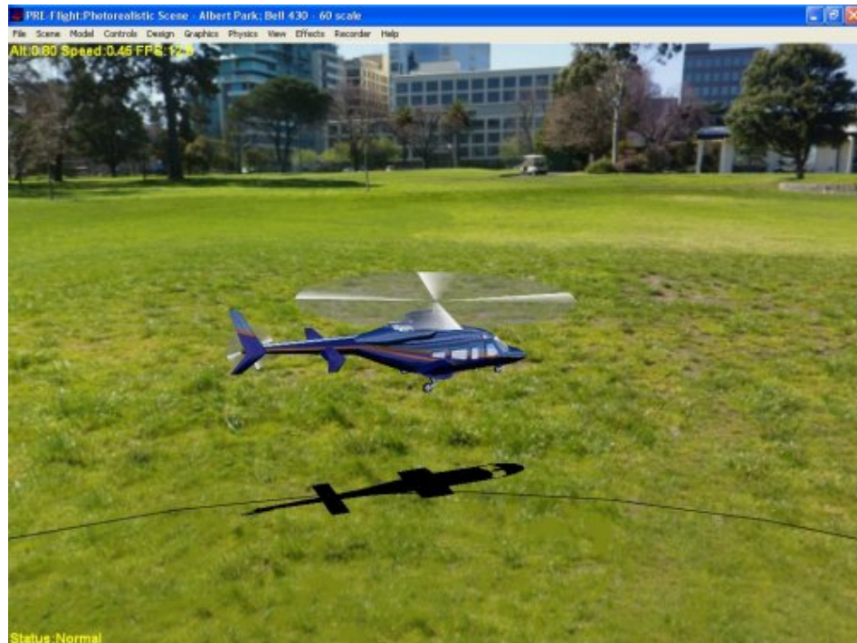
PreFlight with Albert Park photo-realistic scenery

Available directly from the maker Trancedental Technologies. This requires a unique transmitter lead, which plugs into the PC microphone socket.