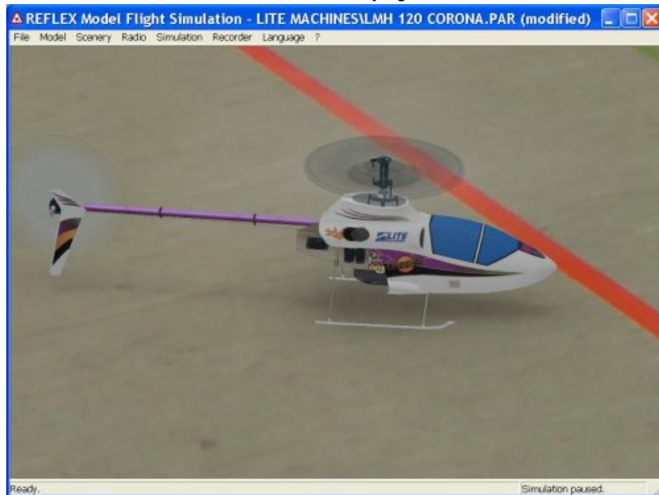
Reflex XTR - Realistic Corona model

People have mentioned the physics model in Reflex seems better than RFG2; however I have not tested this. However, Reflex does not include a USB controller (only USB interface for a