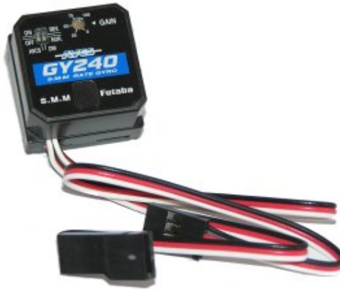
Futaba GY240 gyro

The GY401 is a more advanced gyro with many adjustment options. It requires a dedicated channel for sensitivity adjustment so it requires a radio with at least five channels. Also, the sensitivity is a little tricky to set up properly.