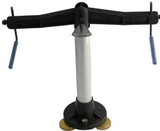
Kyosho Blade Balance

I highly recommend CAing the tip of a sewing pin to the pointer of the KSJ-528 to make the scale easier to read.