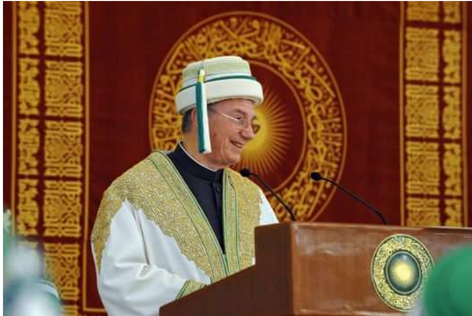
Mawlana Hazar Imam addresses the 26th Convocation of the Aga Khan University, a historic occasion marking the 30th anniversary of the granting of the University's charter.