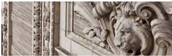
The Lancaster County Convention Center