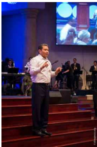
Satanic Hand sign

http://www.youtube.com/watch?v=-J03-MreOpg