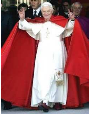
Satanic Hand sign