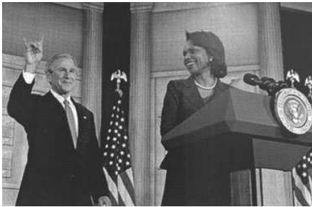
Satanic Hand sign