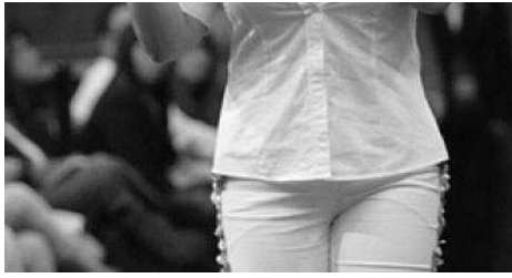
Satanic Hand sign

http://www.youtube.com/watch?v=yxQr9mnXv90