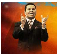
Satanic Hand sign

False Modern Apostles & Prophets: How to recognize them -