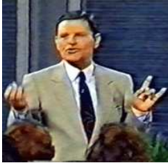
Satanic Hand sign

http://www.sodahead.com/living/jennifer-lopez-vs-marisa-miller-who-wore-it-better/question-3815889/