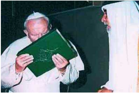
John Paul II Kissing the Koran

http://www.youtube.com/watch?v=SMrKet8S1qA