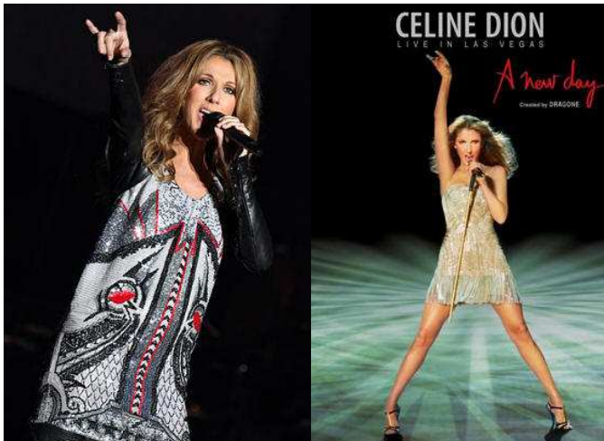
Satanic Hand sign