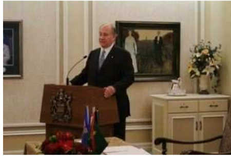
Mawlana Hazar Imam addresses the gathering at Government House,

http://www.akdn.org/videos_detail.asp?Videoid=176