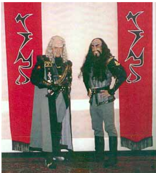
Thanks to the KAG Marines site for this holo-image of Admiral Kruge (left) and Captain Kalex (right)