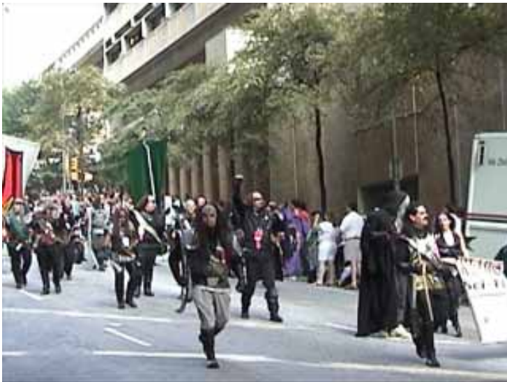
The Klingons followed Captain Sulu in the 2nd Annual Dragon*Con Parade. They made a formidable showing.