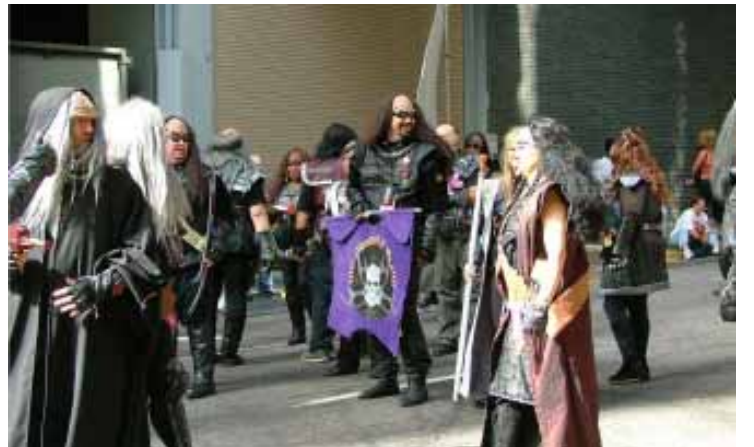
The beauty of a Klingon woman, in this case, Marine Captain Q'Sin vestai-DevnoH, draws every hu-man's eye . . . and a few Klingon's as well!