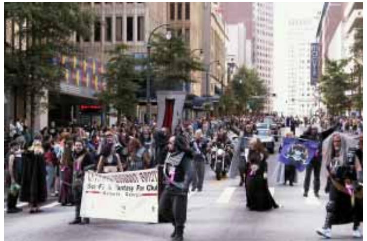
Klingons on the march in Downtown Hotlanta! Qapla'!!!!