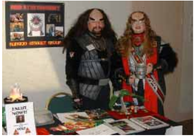
BLAST FROM THE PAST: Trinicron 2002, Lt. Cmdr. Ko'Mot vestai-Septaric, CO of the IKV Glory Hunter with Cmdr. Keela sutai-Septaric.