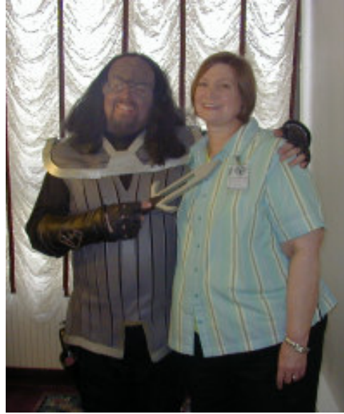
Ever the gallant Klingon lover, Lt. Cmdr. Rlikay takes two females' heart prisoner! Literally!