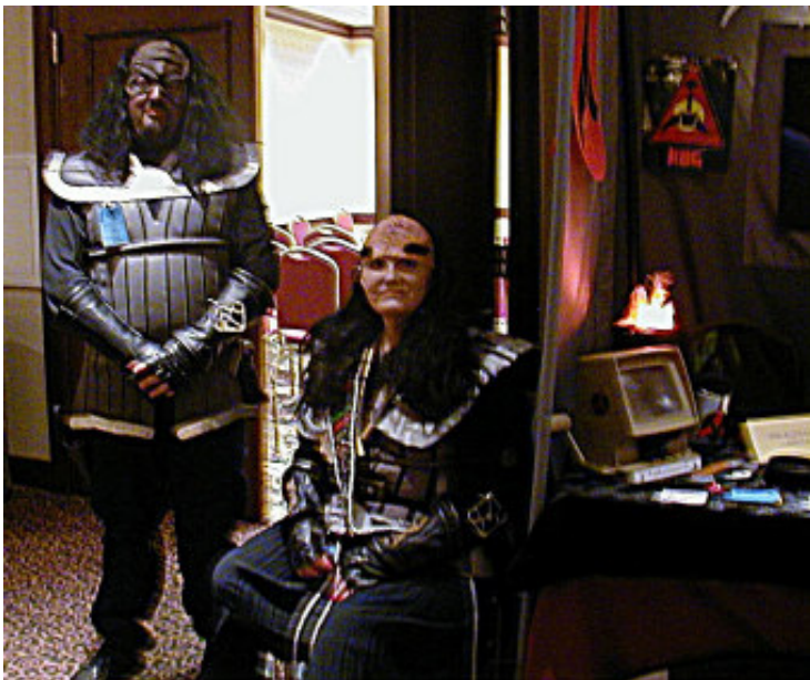
At left Acting Dark Star Quarant CO, Lt. Cmdr. Rlikay sutai-Septaric with House Sister, Ka'Rowe (who is acting as Security) at the new location of the KAG table on Saturday.