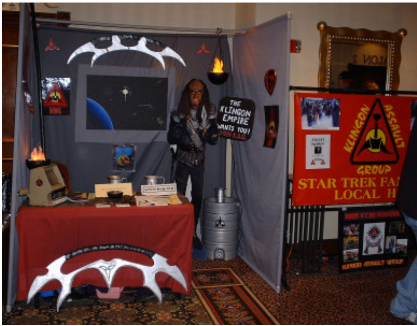
Above, the fully powered up KAG table display with adjoining KAG banner and other posters.