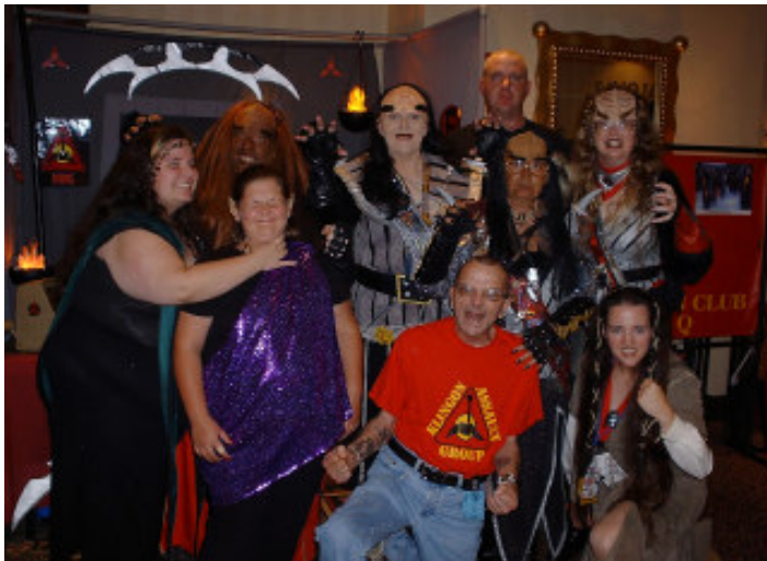
At left, the Klingon War Party on Friday.