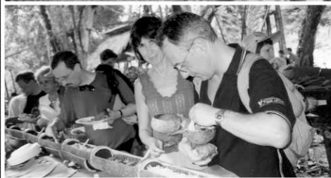
Mitabang Homestay Kg. Tulung-Mantob, Kiulu Website: http://mitabang.tripod.com/ http://mitabanghomestay.com