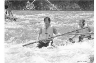
mamangkar (bamboo rafting) 6Km (Xtreme 5M/5M Open - 16Km)