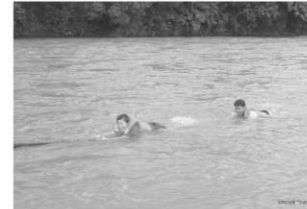
manampatau (swimming with bamboo log) 1.3Km