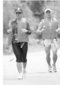
manangkus (running) 5Km (Xtreme 5M - 16Km) 5M Open/Travel Industry/Media 200M

The last event of the K4MC requires its participant to walk/run on rampanau (bamboo stilts). Should a participant fall, he or she is not allowed to take a step forward or backwards, as doing so would mean disqualification. The participant may only climb back onto the rampanau without taking an extra step in any direction.