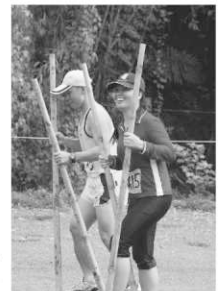
mamarampanau (walking/running on bamboo stilts) 200m