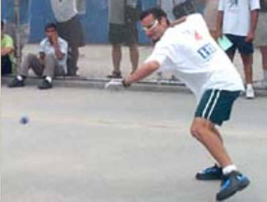
Sala and Sostre showcased their tremendous abilities in the finals