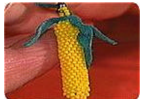
☐ PDF Figure C