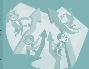
Things Improve with knowledge

while information as power is suggestive of awakening and possible omnipotence, the idea that things improve with knowledge.