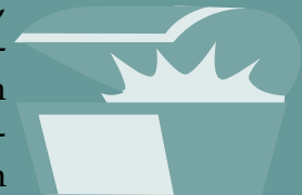
Secrecy as Power

On the contrary, secrecy as power is a procedural dependence, since it relies on a revelation of sorts in order to transmit meaning.