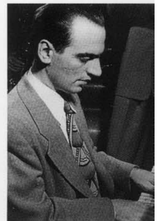
Cooler than cool: Lennie Tristano had an exigent style.

LENNIE TRISTANO — The Complete Lennie Tristano (Mercury): early sessions from 1946–47; Lennie Tristano/The New Tristano (Rhino/Atlantic): sessions from 1955–61, including Lee Konitz.