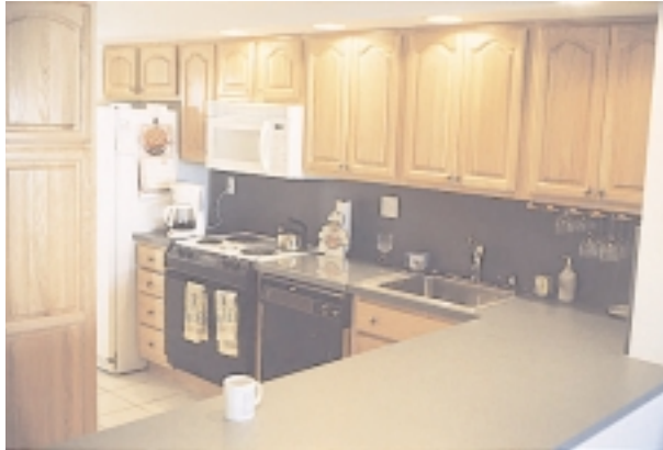
Newly remodeled see-through kitchen with microwave, dishwasher, and icemaker in freezer.

Nearby to great restaurants, attractions, and activities including world renowned John Pennekamp State Park and Marine Sanctuary, fishing, snorkeling, scuba diving, swim with dolphin programs, boating and more!!!