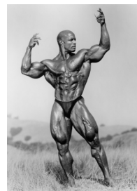
Shawn Ray 12 Time Mr. OLYMPIA top 5! "...most outspoken, controversial, and consistent bodybuilder..." Book/Video: The Shawn Ray Way/Shawn Ray Inside and Out