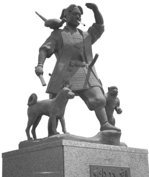
Momotaro and friends in search of a smoking area.

Okayama City Council recently passed a bylaw to remove smoking from public streets in the center of Okayama. The law allows for fines of up to ¥1000 for people caught smoking in prohibited areas, but council workers are currently only actively warning people as part of the gradual process of introducing the law.