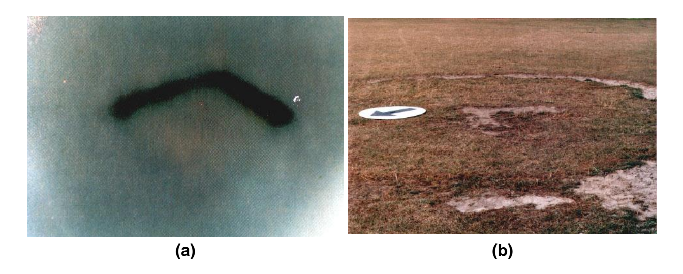
Fig. #B7: Two illustrations from monograph [1/4] which document operation of UFOs. On the left is shown Figure S5 from monograph [1/4]. It presents a photograph of the outlet from the UFO so-called "Oscillatory Chamber", taken during the flight. For more comprehensive explanations and illustrations as to how this Oscillatory Chamber. looks and operates, see descriptions and illustrations from chapter C in monograph [1/4]. Notice that the Oscillatory Chmber is a device which propels UFOs, similarly as our present engine is a device which propels our cars. On the right is shown Figure S3 from [1/4] (also Figure M7 (top) from monograph [1e]. It presents a square scorched mark left on the grass by such cubical "oscillatory chamber" of a landed UFO type K5. This means that it shows the same propelling device, which during the UFO flight was captured on the other photograph shown above (note a scorched square located in the centre of the ring scorched by side propulsors of the same UFO vehicle). The material character of this capsule is clearly visible. For details of the construction and operation of such a capsule see chapter C in monograph [1/4], chapter F in monograph [2e], or chapter F in monograph [1e]. Note that the white circle visible on this photograph to the left from the square scorched in the grass, is used for visual dimensioning of UFO landings - this circle has the diameter of exactly one meter, while its arrow points towards magnetic North.

Above photographs are also shown and extensively discussed on the web pages explain.htm , tapanui.htm , and propulsion.htm .