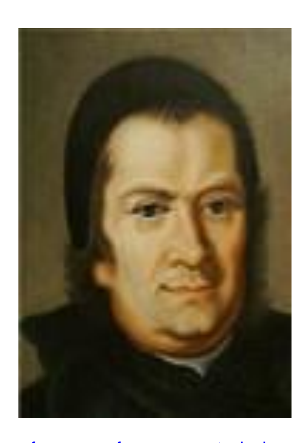
Fig. #G5 : The face of typical male UFOnaut. a The face of a historic figure shown on the above photograph is very similar to a typical face of UFOnauts that are known to me in person, and that operate on Earth as cosmic spies and saboteurs. The only thing that differs slightly from my own observations is the shape of nose. UFOnauts which I know in person have much longer noses that gradually narrow down towards the sharp end, and that finish with a kind of a small groove running between two cartilage plates that form the sharp end of the nose. Actually their long noses for me resembled uniformly narrowing carrots with sharp ends.

Of course, similarly like subsequent people differ from each other, also subsequent UFOnauts may look quite differently. For example the image shown above has black hair. But many UFOnauts have red hair, or are light blonds. Furthermore, in order to hide their characteristic pointed chin, they frequently wear beards.