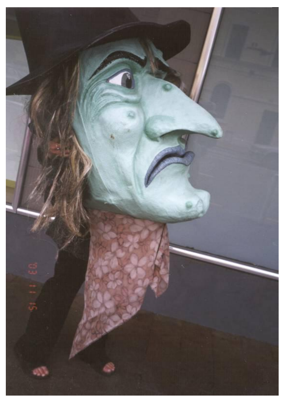
Fig. #E2b: This photograph shows the image of a typical witch, as these creatures are remembered by the New Zealand folklore. Witches are one of many old names used in past for describing evil creatures that presently are called "UFOnauts". The witch shown on this photograph was marching in Wellington, New Zealand, during a Christmas Parade of December 2003. It displays all facial features that are typical for faces of UFOnauts. Namely a long nose like a carrot - in this case curved like a hook, a split end of the chin with two bulges that look like a miniature human bottom, the chin itself slanted down in relationship to the neck to form a kind of hook, and a narrowing down pear-shaped skull that gives the face a triangular shape. (Click on the photo to enlarge it.)

(6) The lack of fold of skin in ears. It is the same fold of skin into which human ladies pin their earrings. UFOnauts do not have it. Therefore their ears in the lower part from their heads like ears in dogs.