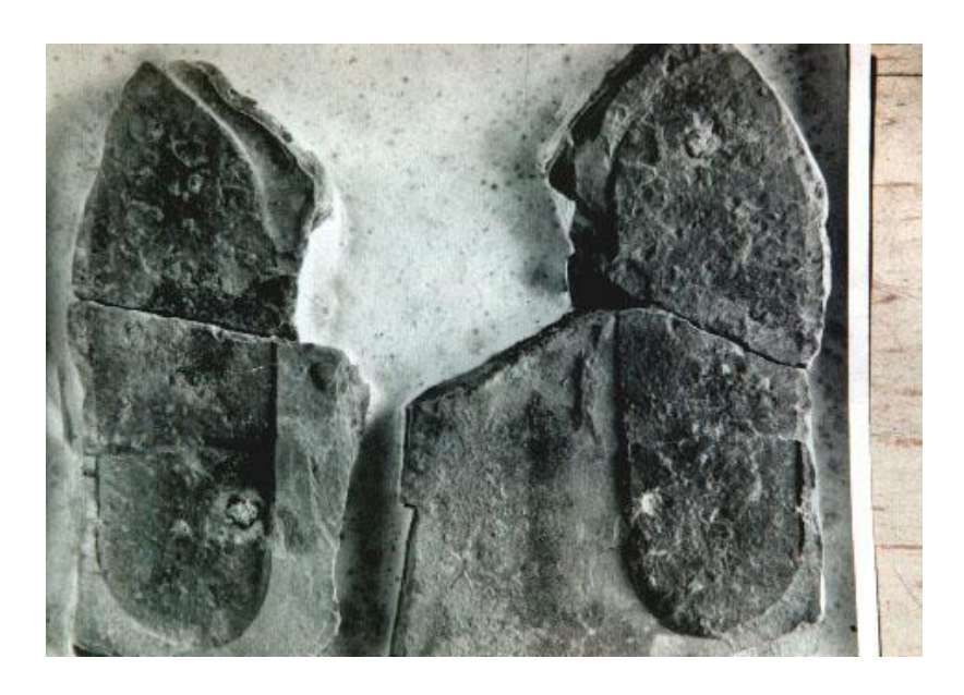
Fig. #E1 : (originally Fig. P31 in monograph [1/4]). It presents an imprint of UFOnaut's shoe 550 millions years old. So already then UFOnauts supposed to be enough advanced to NOT only be able to fly to the Earth from distant star systems, but also were able to initiate the life on our planet.

without putting any work into them. These morally degenerated relatives of humanity were the ones, who actually settled people on Earth, in order to be able to ruthlessly exploit us later. An alternative history of humanity, which describes the fate of our civilization that emerges from recent research on UFOs, is presented in subsection V3 from volume 16 of monograph [1/4] "Advanced Magnetic Devices", and in subsection E7.4 from volume 4 of monograph [8] "Totalizm". If someone ask us whether there is any material evidence that UFOnauts are actually our close relatives who are around 600 millions years older from us, then apart from the above subsections V3 and E7.4 in [1/4] and [8], he/she should also look at Figure O32 in monograph [1/4], or at Figure B1 in treatise [7/2], or at Figure E2 in monograph [8]. These Figures show a photograph of an imprint left rock that was made by a shoe of an UFOnaut. This imprint is around 550 millions years old. This shoe was imprinted on Earth, when ancestors of the present UFOnauts started to spread the first forms of life on our planet, in order to gradually prepare it for the arrival of people, whom they could later exploit forever.