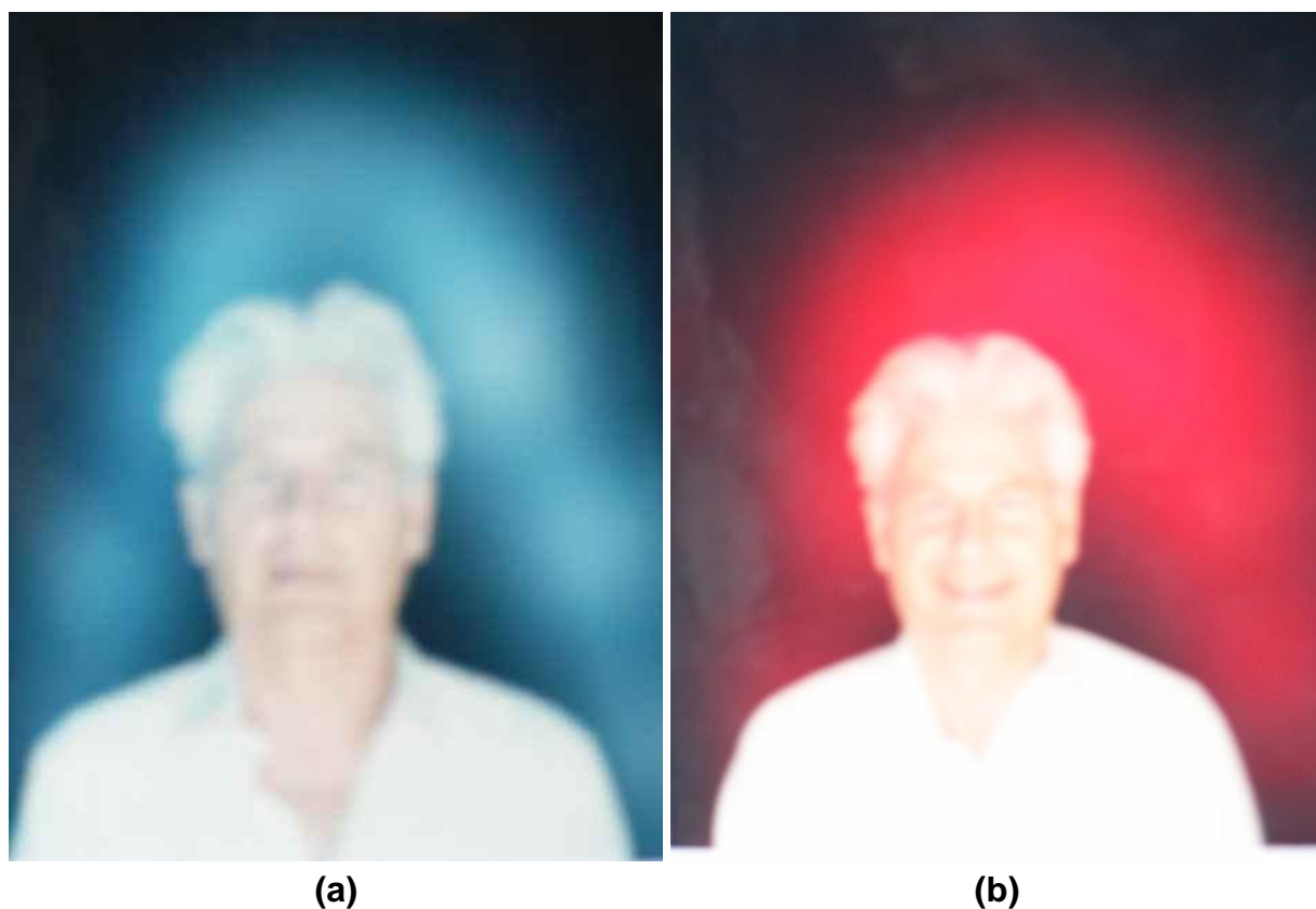
Fig. #E1ab: Two photographs of the aura which surround the same man. Auras that are similarly alive and similarly change their shape all the time, are formed practically by all people and by all living organisms. In turn the fact of the existence of such thing as aura in people and in other living organisms, is one amongst numerous items of evidence for the existence of souls - for details see item #E5 from this web page. Both above photographs were taken with a special photo-camera which principle of operation, that is slightly different than normal, allows to photograph auras. (Such photo-cameras for auras can be purchased since around 1980s, but they are relatively expensive - thus not everyone can afford having them.) Both above photographs were taken with only a short time gap between

The existence of auras proves the existence of souls in several different ways. For example, the sole fact that all living organisms have the aura - in spite that the official human science is unable (and does NOT want) to explain the existence of it, already has such a proving power. After all, if there is such a thing as "aura" which the official human science is unable and does NOT want to accept, it means that in a similar manner there is also the soul, which the same official human science does not want to accept as well. Another significance of "auras" as the evidence for the existence of souls results from the continuous change of it in tact of health, thoughts, and feeling of the owner. After all, such changes in aura reflect changes in all these factors the current states of which are defined by the software soul. Still another evidential value of aura results from the fact that it represents a visible manifestation of some algorithm which controls the behaviour of life energy. In turn, for the behaviour of this energy to be controllable, there must exist some program (i.e. the soul) which contains in itself the algorithm that described how this energy should be controlled.