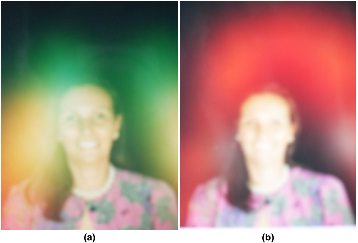
Fig. #E2ab: Two photographs of the aura that surrounds the same woman, taken with short time gaps between each other in two situation when this woman changed noticeably the subject of her thoughts and the category of feelings which she cultivated about the subject of these thoughts. Notice that both, shapes as well as colours of her aura are for this woman completely different than for the man shown in "Fig. #E1ab". (Click on the selected photograph above to see it enlarged or to shift it to other area on the screen.)

Fig. #E2a (left): Specific thoughts and feelings cause the formation of aura with unique shades of green. (Explanations of what exactly kind of thoughts and feelings formulate such auras would be an excellent subject for a separate web page.)