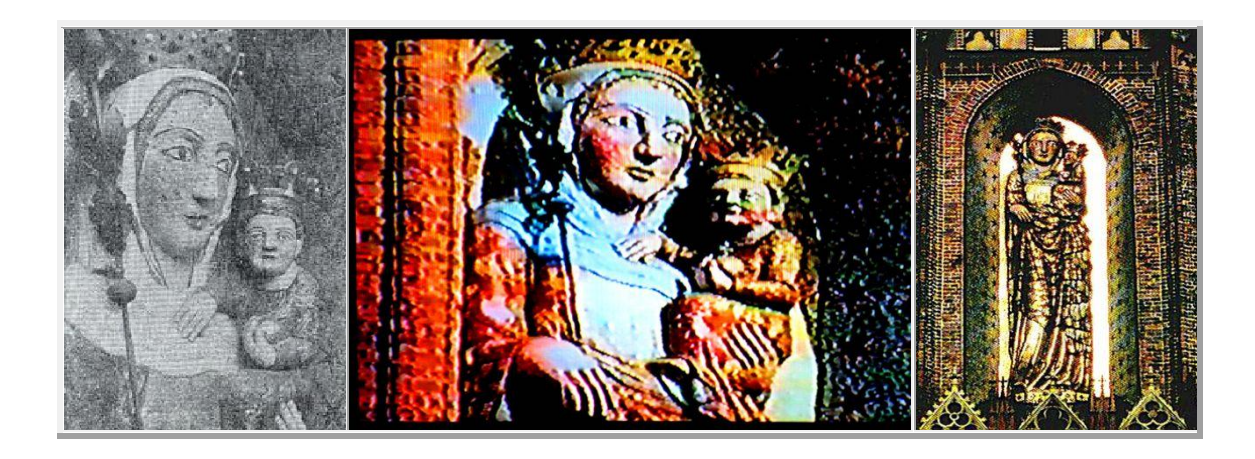
Fig. #D1abc: Here is how old photographs portray the stucco statue of Virgin Mary from the church in Malbork Castle. About this statue exists an old Polish prophecy stating that "on lands of Slavonic Pruses which are overlooked by this statue, the German language is to prevail for as long as long this statue watches these lands". This old prophecy already fulfilled itself once. As we know this statue was mysteriously destroyed at the end of Second World War. Simultaneously the German language diminished on lands of Slavic Pruses which this statue supervised. But in 2007 a group of Polish citizens organised in a foundation named Mater Dei unilaterally (and extremely unwisely) decided to let us experience whether this prophecy fulfils itself again. These Polish citizens initiated a vigorous action to restore this statue. So we will have the opportunity to see whether, after the statue is restored, also the power of the old Polish prophecy linked to this statue is to return. Means, whether the German language returns to this land. The first supernatural acts of this just restored statue already started to be manifested. These acts boil down to court orders taking away lands and homes from present Polish owners and giving these back to former German owners, and also on sending illness to the opposing of rebuilding this statue. Descriptions of these new supernatural acts of that statue are provided in items #C6 and #F1 to #F3 of the web page malbork_uk.htm. (Click on the selected photograph if you wish to enlarge it.)

As these photographs illustrate it, the statue of the Malbork Madonna was modelled in the positioning that represents the expansion and control over lands that this statue overlooks. Thus it symbolised perfectly the intentions of Teutonic Knights who erected this statue, enforcing with its supernatural powers the aggressive activities of the Teutonic Knights. So if this ill-omened statue is restored in present times, for the security and the prophecy reasons its aggressive and hostile position should be intentionally changed (as the <a href="mailto:philosophy of totalizm">philosophy of totalizm</a> and also the Chinese <a href="mailto:feng shui">feng shui</a> advices this to us - see item #C5 on the totaliztic web page <a href="mailto:malbork">malbork</a>), thus making it to symbolise and reinforce with its supernatural powers the present situation of the lands that it supervises. How to accomplish this task is explained in item #C5 mentioned above.