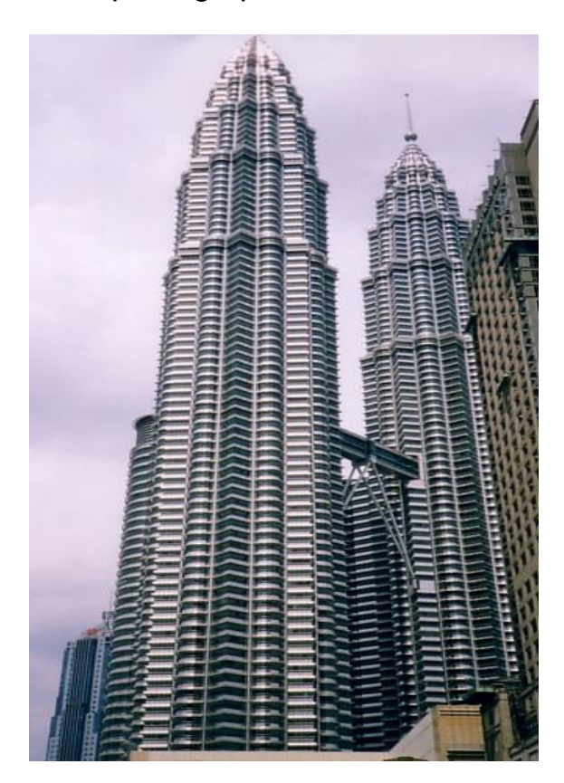
Fig. #3 (C3 in [10]): This is how the "Twin Towers" (KLCC) from Kuala Lumpur in Malaysia look like. These towers were constructed in the period of time when I was on my professorial contract in Malaysia. Thus they are relatively sentimental buildings for me, as in some sense I feel as if I was participating in their construction. At present these are the only twin towers in the world left still standing. Their fame spread around the world enough that presently are equally well known as were the WTC skyscrapers from New York. The famous "Sky Bridge" is visible on this photo as it links both towers approximately at less than a half of their height. How this Sky Bridge looks like inside it can be seen in the previous "Fig. #2".

"twin towers" in the centre of Kuala Lumpur, Malaysia. They are the only "twin towers" in the world still left standing, which belong to the exclusive club of highest buildings in the world. The "Sky Bridge" links both these towers at slightly less than a half of their heights. The positioning of this sky bridge which links both towers, is visible on the next photograph of the entire KLCC.